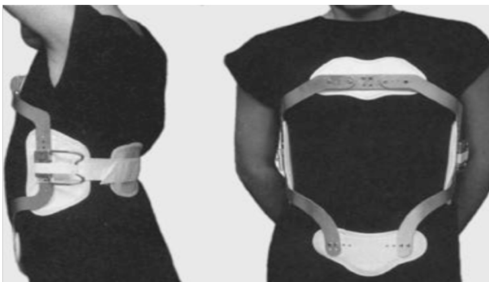
Figure 1: Immobilization and / or Thoracolumbar orthosis

After dorsal instrumentation for fractures of the thoracic and lumbar spine, implant-associated discomfort is possible. In addition, in non-fusion procedures there is the risk of implant failure. In these cases the hardware should be removed.